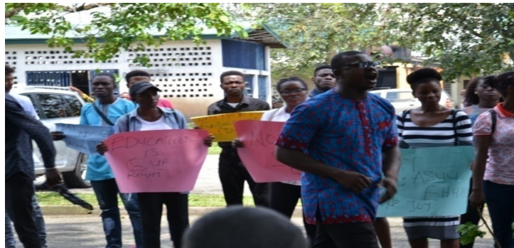
Plate 13: ASUU Chairman expressing anger over the situation in the system.

Yes! But the government has always broken hers. Sometimes telling us they never entered such agreements with us.