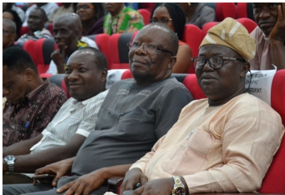
Plate 4: Shows ASUU National President and some members of his executives sitting in the front, keenly watching the “Gbuji” performance.

I want to remind comrades seated here today that ASUU as a union, has mechanisms in place. We encourage students to come and report such cases. We attach female lecturers to such cases and victims. We have cases where we suspend our members as parts of disciplinary procedures, once a prima facie has been established against the lecturer who is involved in such abuse. The only thing is that we don't need to go to press to discuss such suspension. We should be conscious of our ethical responsibilities. We must remember that we are role models, local parents and mentors to our students.