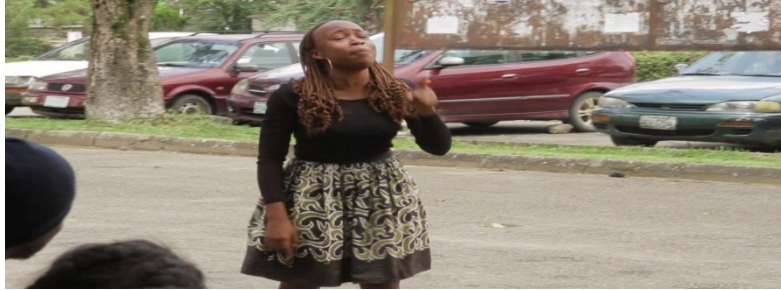
Plate 20 shows a stakeholder expressing her thought.

ASUU President, have you ever asked how the parents and the society survive during your so-called strike?