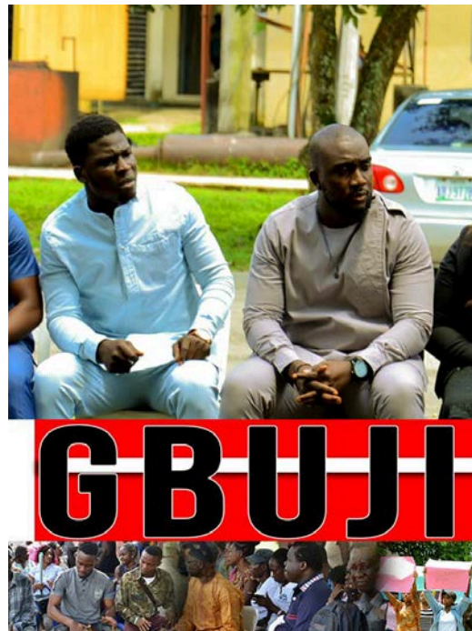
Plate 8:Four (4) units of action from the production merged: government officials, ASUU, students, performers.

So, Permanent Secretary, your opinion is that we carry all the money in this country and give to ASUU because education according to you is very, very important abi and you forget we are fighting insurgency, corruption and the rest of them?