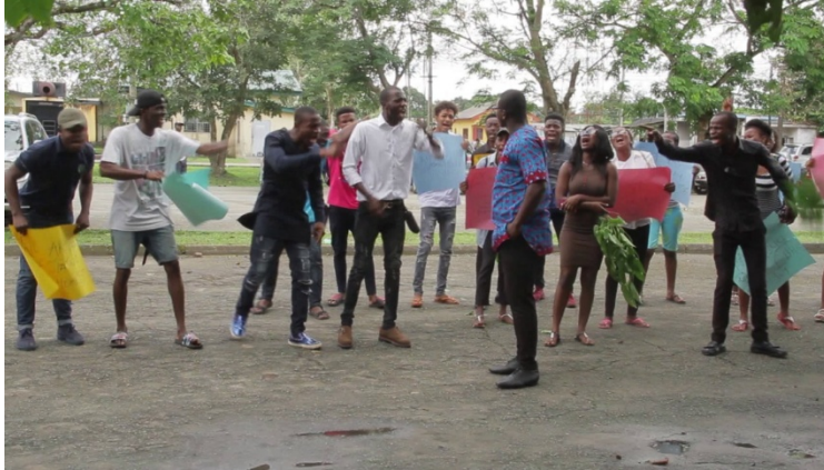
Plate 12: This plate shows the students in argument.