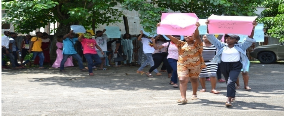
Plate 19 shows protesting students.

for the both parent and individual student, in a highly competitive and relatively low return on investments on education society. The picture of the protesting students is the best example to explain this.