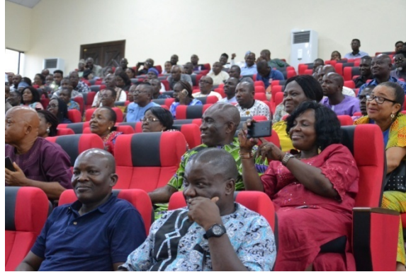
Plate 6: Shows delegates with their eyes fixed on the performance, while a few are seen recording the performance with joy.

There should be no sacred cows in the process and when all these are done, lecturers will protect the sanctity of the Ivory Tower. It was unanimously agreed that nowadays, some lecturers that come into the system actually do not know what it takes to be a father figure or a mother figure to students, especially when the lecturers are young. Conclusively, it was agreed that lecturers, especially the younger ones should be inducted and made to be aware of their responsibilities and the certainty of sanctions in the university.