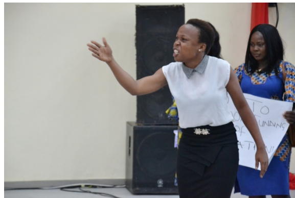
Plate 2: Shows a student expressing her sentiment against the ASUU leadership.