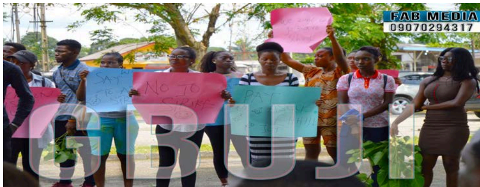
Plate 18 shows students in a protest mood.

impact could be classified negative and positive due to those affected simultaneously by the activities of the union in Nigeria. Although the impact of ASUU in the society is enormous, we shall consider a few as were projected by the play production. The frequent and unmanageable industrial action (strike) often executed by ASUU is not at most the best approach for the government to meet their demand because the final point of the action definitely fall on the lower class in the society, especially the underprivileged Nigeria students. The poor are greatly affected with the actions of ASUU giving that during their strikes, the government officials and the rich Nigerians always have their children flown overseas in search of education which is fast dying in Nigeria by the actions and inactions of the these politicians. The students having known the mysterious impact of the strikes on them staged a protest against the lecturers and Nigerian government trying to prevail on both parties to settle their difference so that they can remain in university. The pictures below best explain this situation.