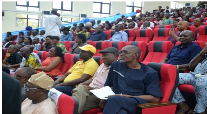
Plate 7: Shows a cross section of delegates watching the performance with keen interest.

There should be no sacred cows in the process and when all these are done, lecturers will protect the sanctity of the Ivory Tower. It was unanimously agreed that nowadays, some lecturers that come into the system actually do not know what it takes to be a father figure or a mother figure to students, especially when the lecturers are young. Conclusively, it was agreed that lecturers, especially the younger ones should be inducted and made to be aware of their responsibilities and the certainty of sanctions in the university.