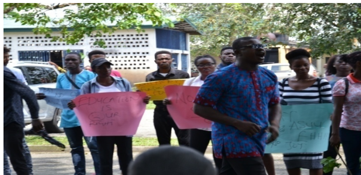
Plate 13: ASUU Chairman expressing anger over the situation in the system.

Yes! But the government has always broken hers. Sometimes telling us they never entered such agreements with us.