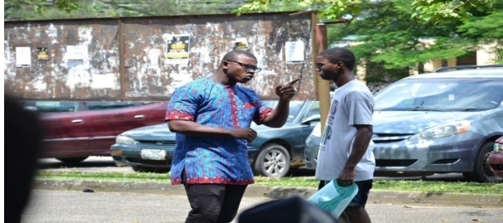
Plate 14: ASUU Chairman cautioning a student whose intention was to stir the students into an ungodly revolution.