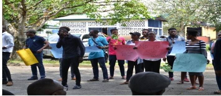
Plate 15: Students protesting and one of the students expressed grief over the level of rot and decay discovered in the university system.