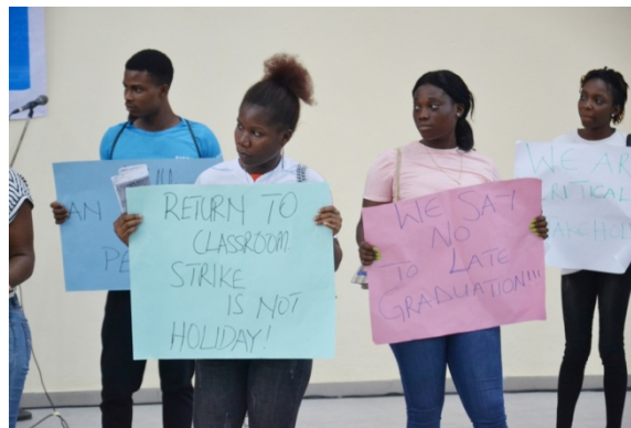
Plate 3: Shows the students displaying placards with inscriptions about ASUU industrial action.

This particular act UNIPORT ASUU NEC remarked has kept the government wondering, especially when the union complains of understaffing (inadequate manpower), and falling standard of education in Nigeria universities. During the follow-up activities, ASUU national leadership observed that the impersonation by lecturers or accreditation malpractice as the students tagged it in the performance, as carried out by members is highly unethical, and promised that henceforth the union shall device a means of addressing it squarely. Speaking on this issue, the former national President of ASUU, Dr NasirFaggeIsa submitted that the few times he was on the accreditation team, the universities he visited attempted to bribe, but he vehemently rejected the offer, noting that such highly unethical practices should be discouraged. Consequently, he was never invited in subsequent accreditation exercises.