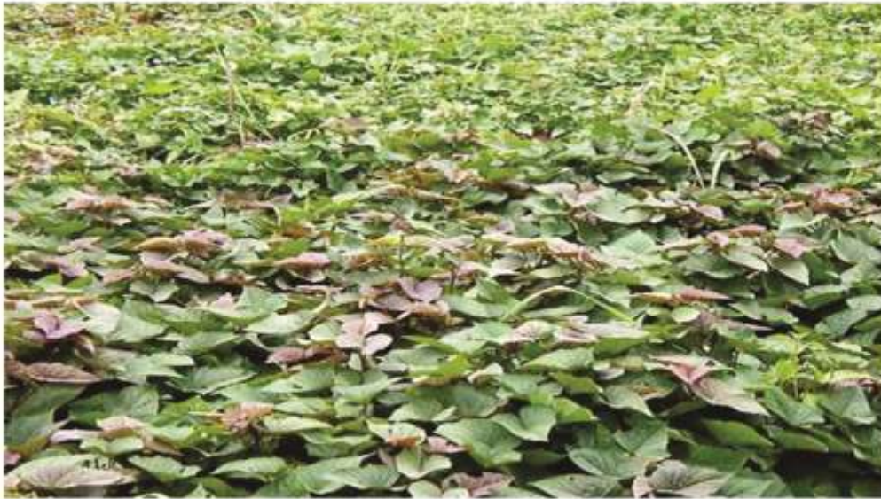
Plate 13: Sweet potato Demonstration farm at the NRCRI and proceeds