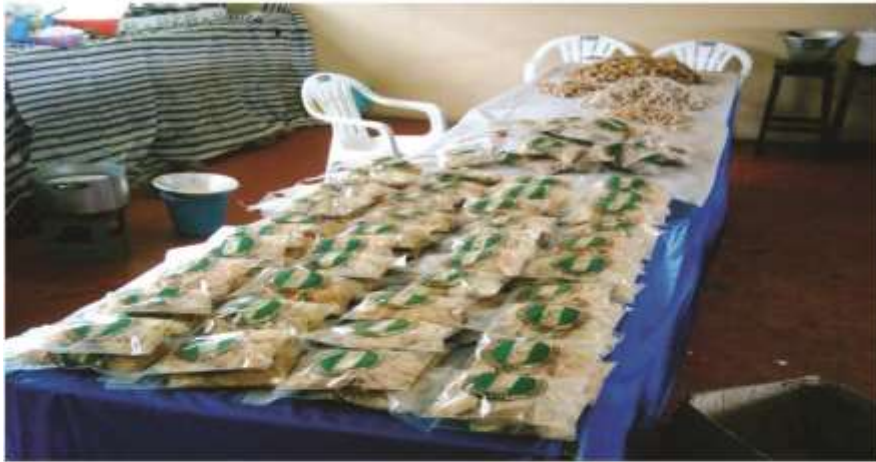
Plate 22: Some value added products of the Post-harvest Programme at the NRCRI