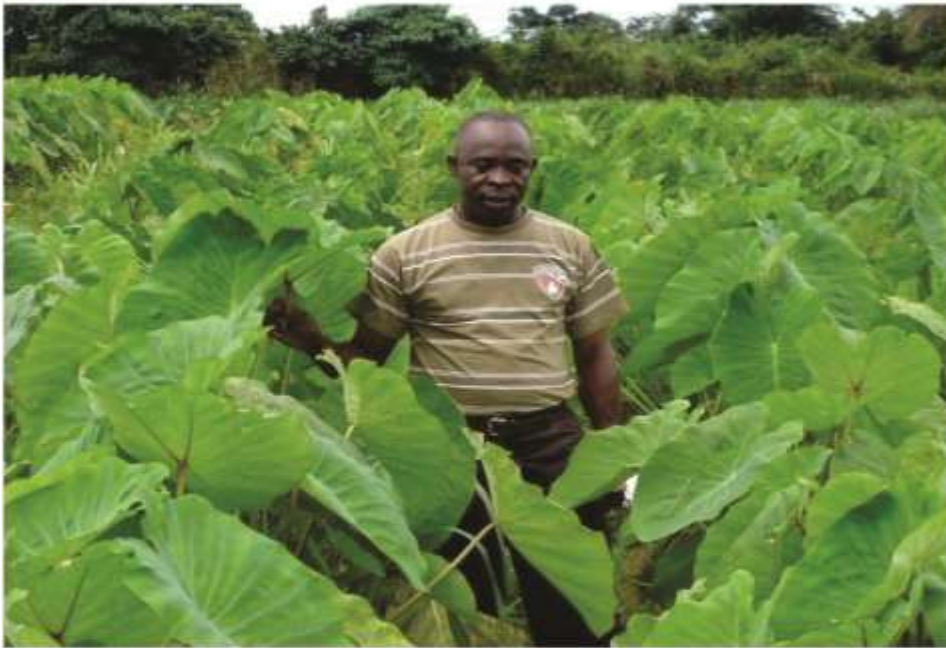
Plate 18: Cocoyam Demonstration farm at the NRCRI and proceeds