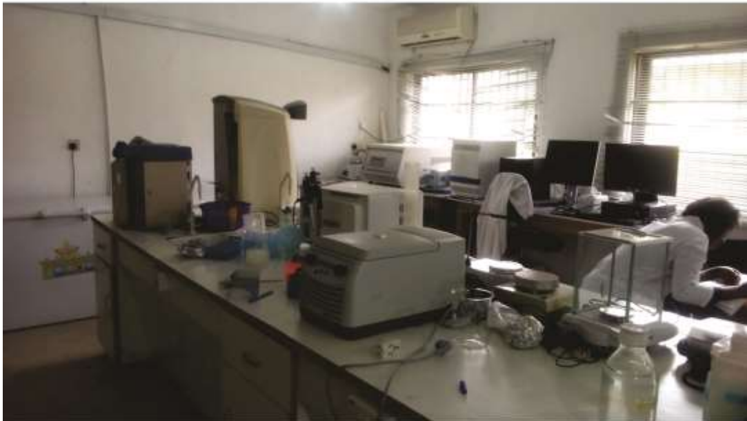
Plate 20: Biotechnology Laboratory at the NRCRI