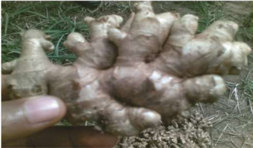
Plate 15: Improved Ginger varieties and Ginger Demonstration farm at the NRCRI