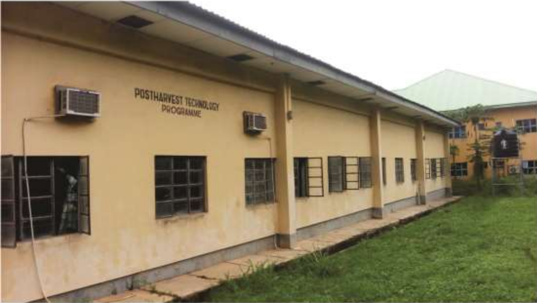
Plate 23: Post-harvest programme of the NRCRI and commercial driers