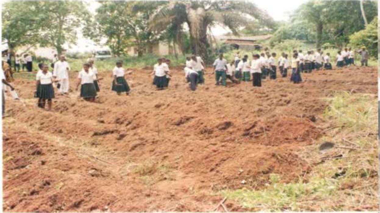
Plate 10: NRCRI Adopted School Programme