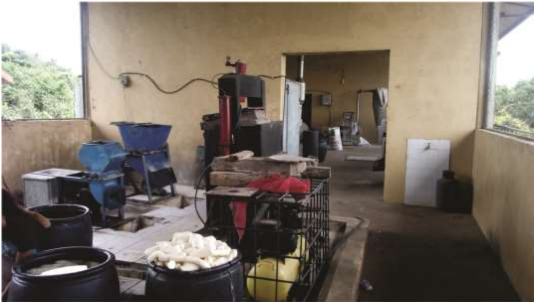
Plate 11: Cassava Programme of the NRCRI