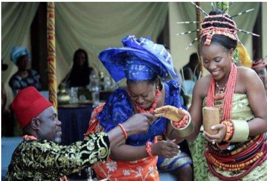
Plate 2. Showing traditional marriage ceremony ( igba nkwu ) in Afikpo

has been abandoned as a result of globalization. As it is in the Western world, there is courtship which gives room for immorality. Many young women now get pregnant for their would-be husbands before they wed. Church or Christian marriage is fast taking over from traditional marriage. Couples are issued with marriage certificates after wedding. Monogamy is fast substituting polygamy and virtually all the aspects of Igbo traditional marriage is caving in to the western system of marriage.