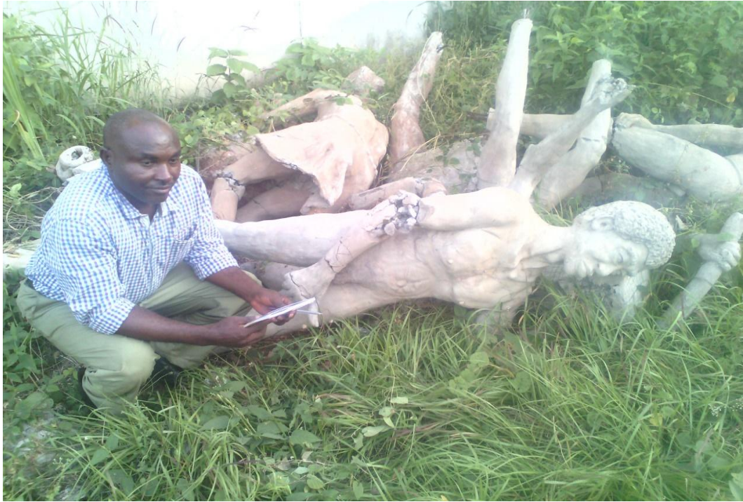
Plate 13: Showing the researcher with the demolished Sculptures at Mbari Centre, Owerri