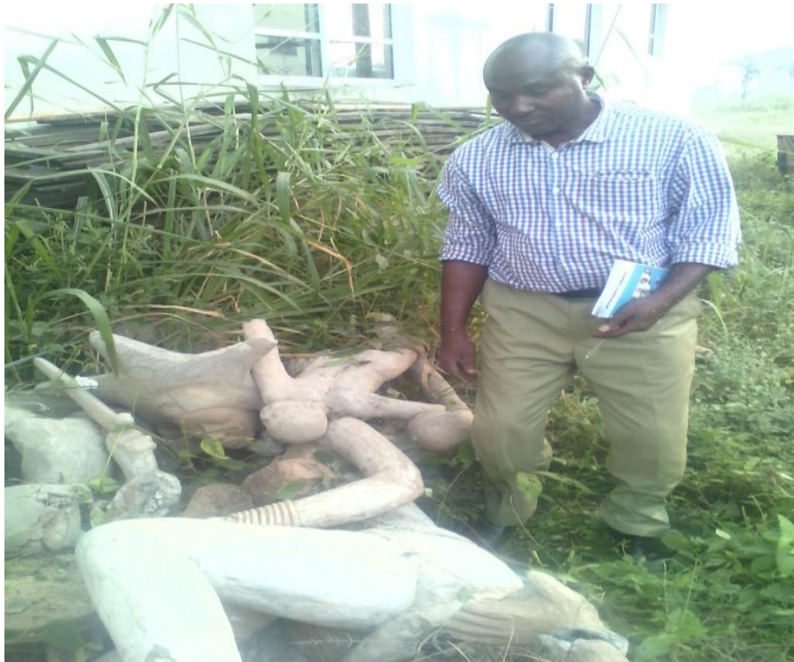
Plate 9: Showing the researcher at Mbari Centre with the relics of the Earth Goddess

The picture of the Earth Goddess was that of a woman wearing a long hair, pointed nose and a cross on her chest; a reflection of the contact the Igbo artist made with the Europeans. The use of an umbrella was a late introduction after European contact and one sees the picture of the Earth Goddess holding an umbrella as a covering for rains. Unfortunately, the sculpture representing the earth goddess was among the sculptures destroyed at Mbari Art Centre.