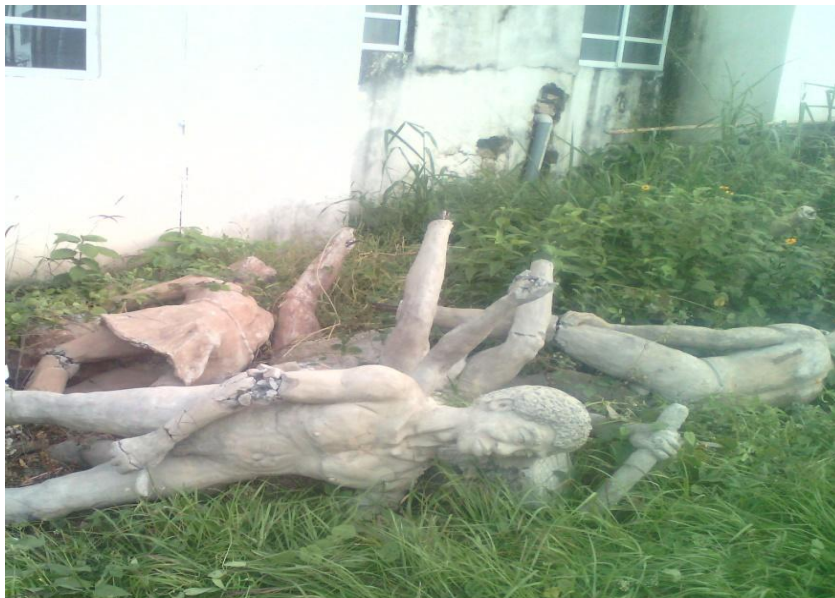
Plate 10: Showing Mbari Centre in Owerri, Imo State after demolition

According to A.Iheanacho (personal communication, 11 th November, 2017), the Art Centre was a very important museum for Igbo culture. Mbari was central to the understanding of the Igbo identity, industry, religion, education and creativity. The centre which was originally constructed with mud had sculptural representation of different animals and gods of the Igbo pantheon. Among these sculptures were the Nguma which the Igbo traditional religion sees as the Chief Security Officer of the god, Amadioha . Tigers, snakes, water mermaids, gongs and other sculptures and murals deemed significant to the worship of the earth goddess, Ala were well represented. The centre is in ruins and all the totems and murals completely distorted. Most of the sculptures and artifacts have been lost. This is a formidable challenge to Igbo traditional religio-cultural renaissance.