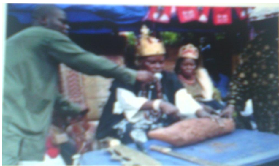
Plate 11: Showing a traditional ruler performing traditional rites at a New Yam Festival in Onicha