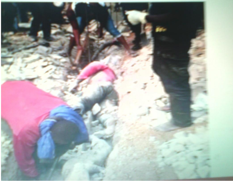
Plate 16: Showing the three corpses buried in the foundation at Ugwuaji being exhumed