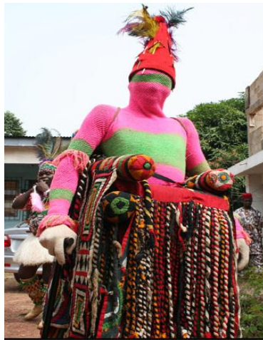
Plate 3: Showing mmanwu masquerade in Uburu

For instance, Abigbo and Ekere-Avu dances which stand for social critics are from Mbaise community in Igboland and were used for social criticisms against governments and powerful people in the community, which a single person could not do without being victimized. The Mmanwu which stands for masquerade dance groups were widely used to protect deities and to deliver judgements or administer punishments on otherwise powerful people because masquerades were untouchable and feared to be spirits. Young men were enlisted into the group to effectively act or serve as local police.