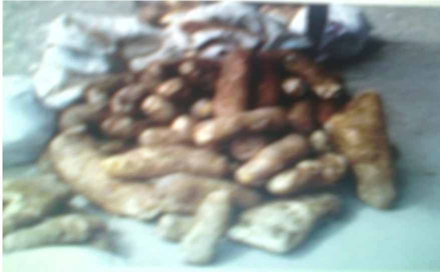
Plate 12: Showing new yam tubers during the New Yam Festival in Afikpo

Besides, Ahiajoku is a Pan-Igbo event meaning that other South East and South South states are also involved. The festival is domiciled in Imo State which takes the responsibility of funding it annually.