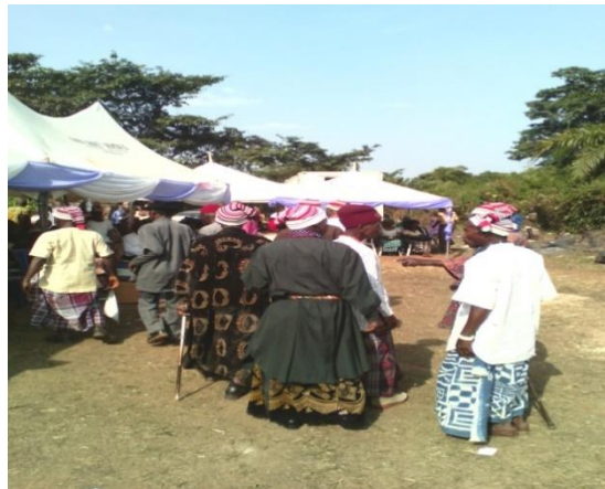
Plate 1: Showing modern Igbo traditional attire at a burial ceremony in Edda

Traditionally, the attire of the Igbo generally consisted of little clothing as the purpose of clothing then was to conceal private parts although elders were fully clothed. Children were usually nude from birth till adolescence, that is, the time they were considered to have something to hide but sometimes ornaments such as beads were worn around the waist for medical reasons. Uli , that is body art, was also used to decorate both men and women in the form of line-forming patterns and shapes on the body. Maidens usually wore a short wrapper with beads around their waist with other ornaments such as necklaces and beads. Both men and women wore wrappers. Men would wear loin clothes wrapped around their waist and between their legs to be fastened at their back, the type of clothing appropriate for the intense heat as well as jobs such as farming. Men could also tie wrapper over their loin clothes. However, modern Igbo traditional attire is generally made up (for men) of the isiagu top which resembles the African dashiki . Isiagu or ishiagu is usually patterned with lion's heads embroidered over the clothing. It can also be plain, usually black. It is worn with trousers and can be worn with either a traditional titleholder's hat called okpuagu or with the traditional Igbo striped men's hat which resembles the bobble hat.