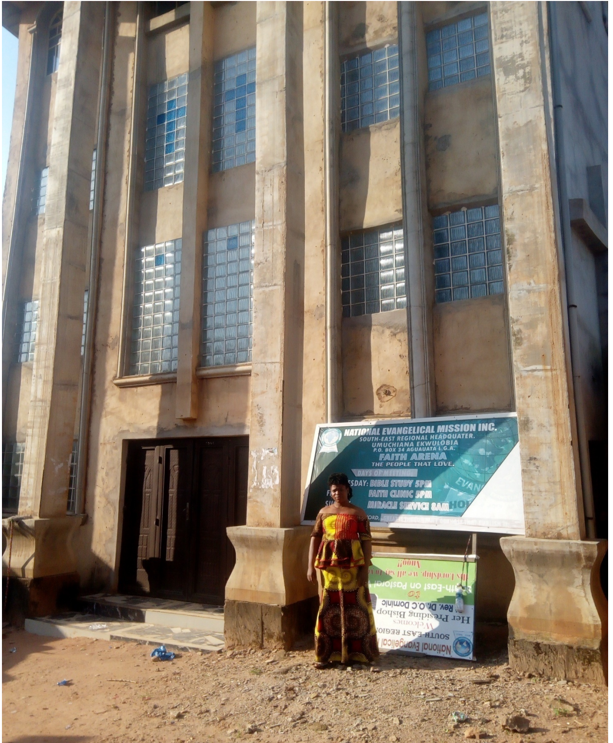
NATIONAL EVANGELICAL MISSION, EKWULOBIA