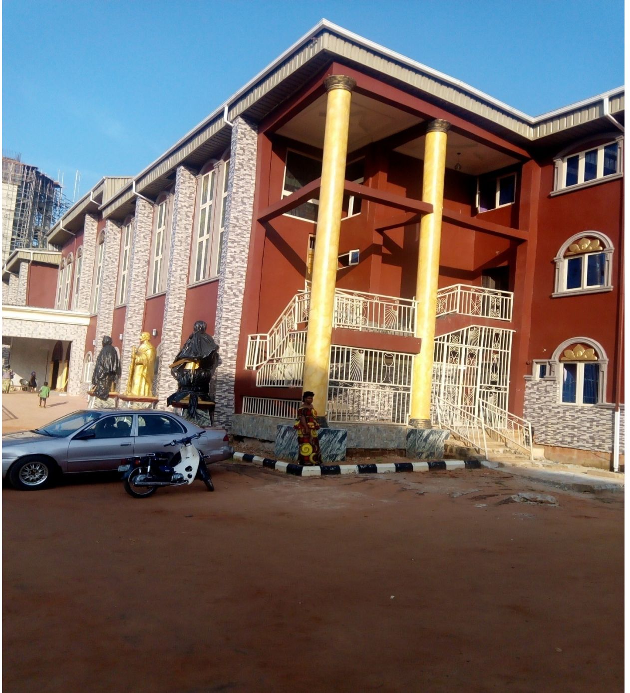
ST JOSEPH'S CATHOLIC CHURCH, EKWULOBIA, AWKA DIOCESE