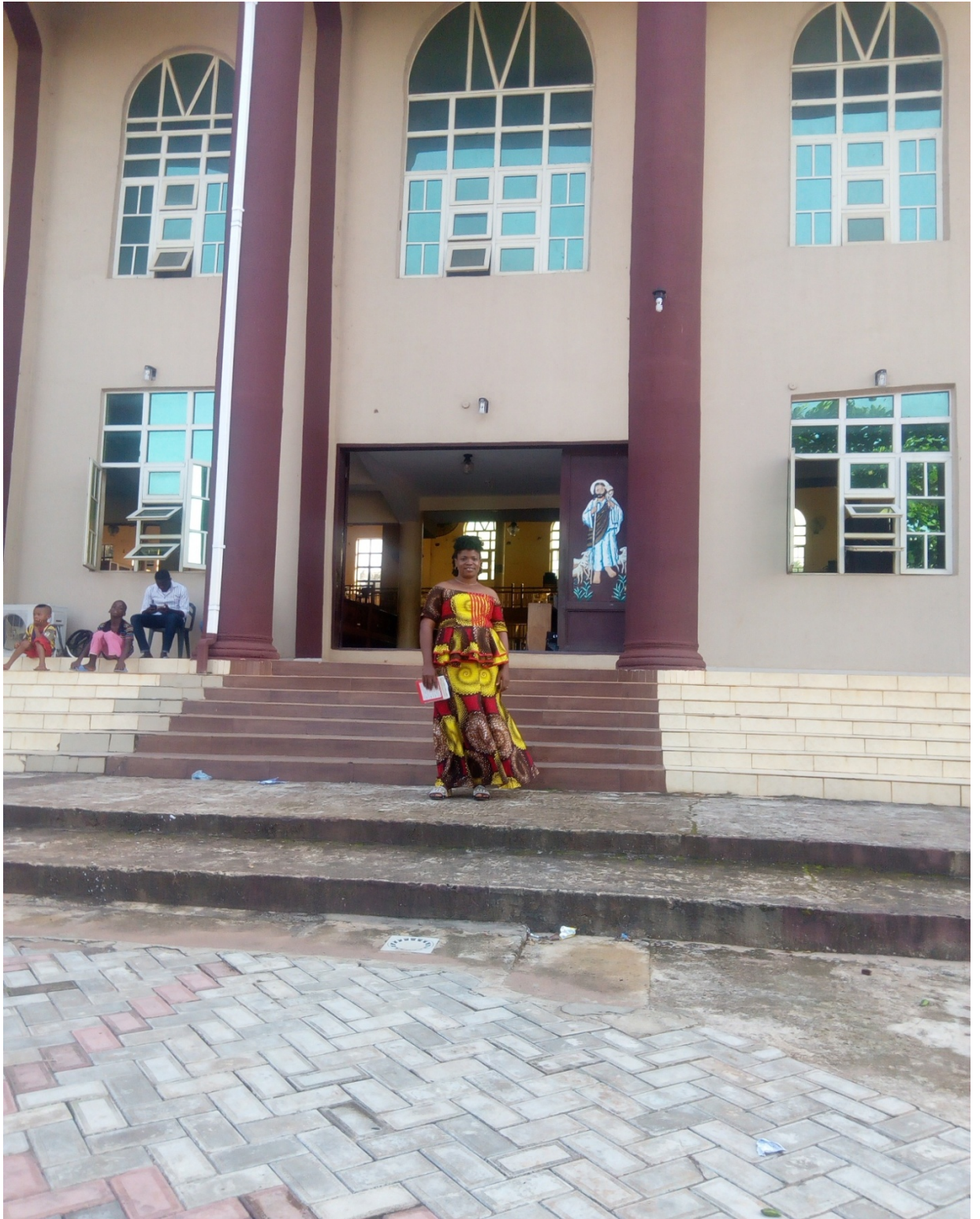
THE CATHEDRAL CHURCH OF ST JOHN, EKWULOBIA, DIOCESE OF AGUATA