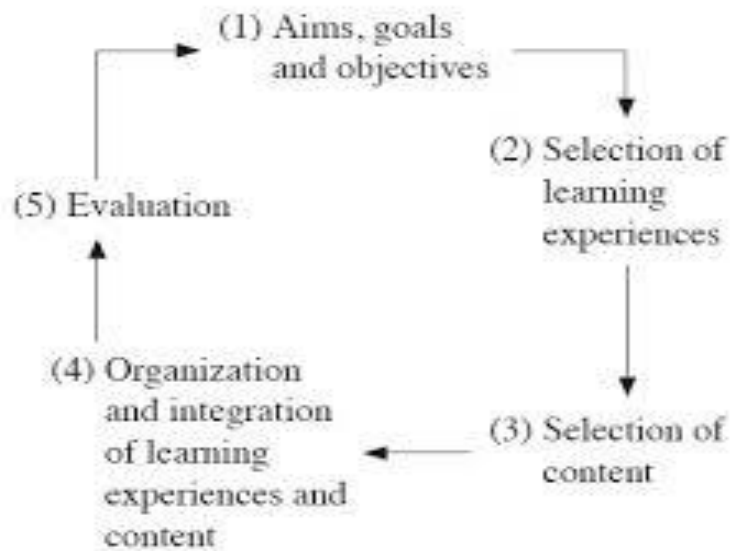
Fig.2: Wheeler's Curriculum Model